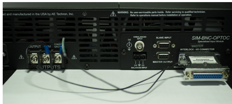
Figure 1 - GCL installed on 7224 amplifier